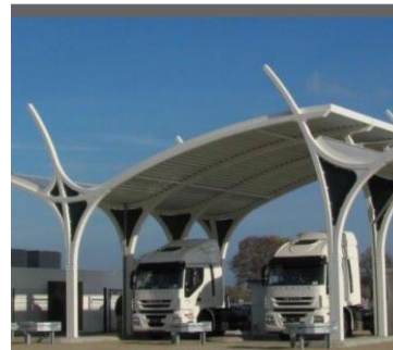
Verkenning van de veiligheidsconsequenties van innovaties in de transportsector